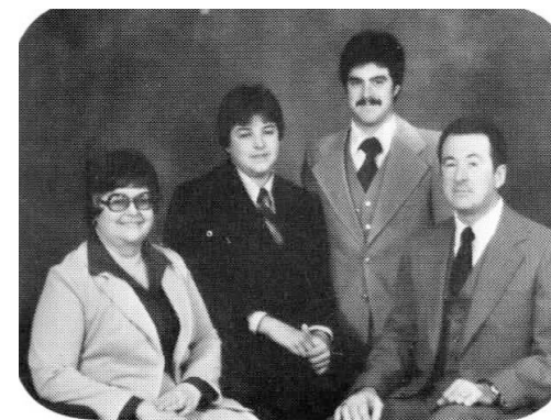
Do you know this family? From Zion's 1980 Directory (Answer inside back page)