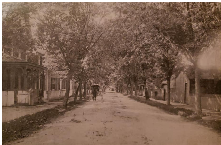
Looking northwest on Locust Street from High Street at the turn of the century

March 17, 1883 - Last Sabbath the various pulpits of Cambridge were occupied by ministers of the Wilmington Conference. The audiences were large and the good work done will be lasting. Zion M. E. Church was packed to its utmost capacity to hear the Bishop at the morning service, and during the entire session immense crowds showed their interest in the proceedings.