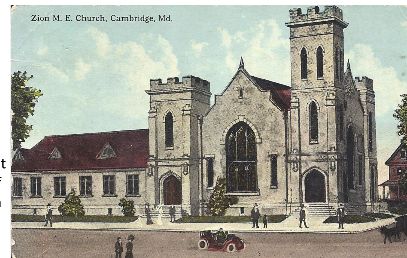
Post card of the "new" Zion M.E. Church. Note that the education wing was a single story with a pitched roof.