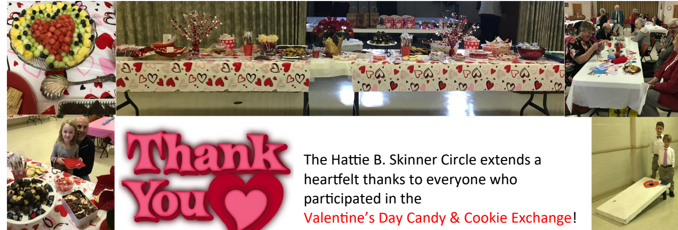
The Hattie B. Skinner Circle extends a heartfelt thanks to everyone who participated in the Valentine's Day Candy & Cookie Exchange!

Whether you contributed your favorite treat or just enjoyed the treats, it was a wonderful (and delicious) time of fun and fellowship for kids of all ages! Treat boxes were also sent to our college students.