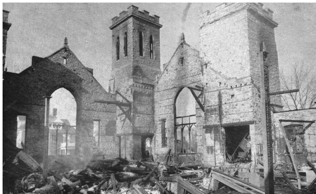
This photo is from an old post card, most likely from the early 1950s, sent to us by Pat Vane.

Democrat & News- October 13, 1894: The Fire Co. is trying to secure money enough to buy a large whistle to be placed on the factory to be blown as a fire alarm. The ice factory runs night and day and a whoop-her-up whistle on it would be very effective.