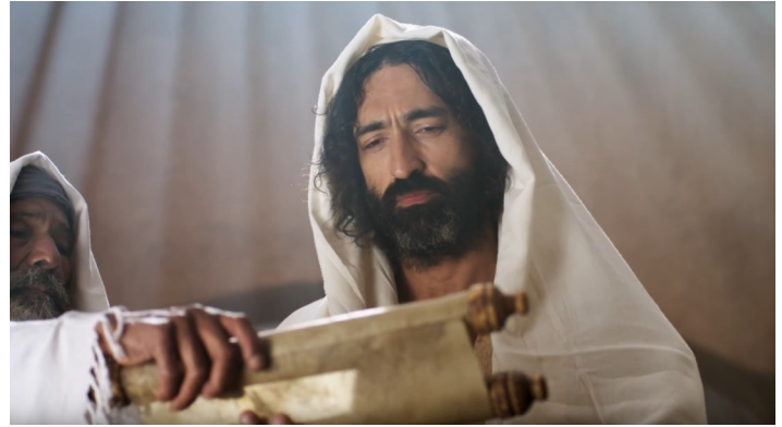
The scroll of the prophet Isaiah was given to him.