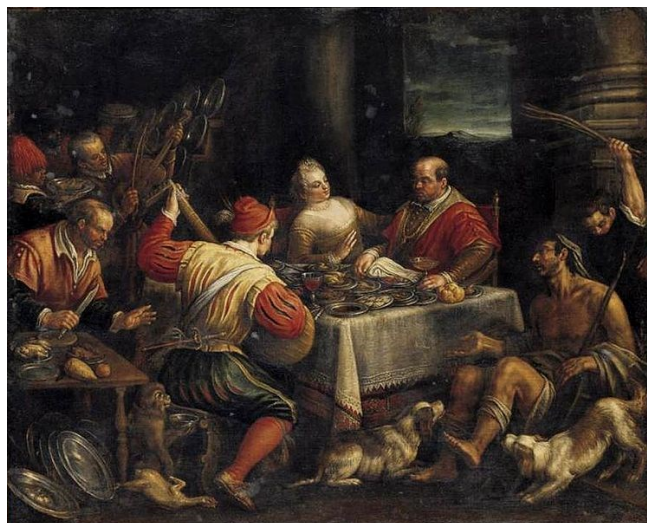
The Rich Man and Lazarus—Leandro Bassano circa 1600